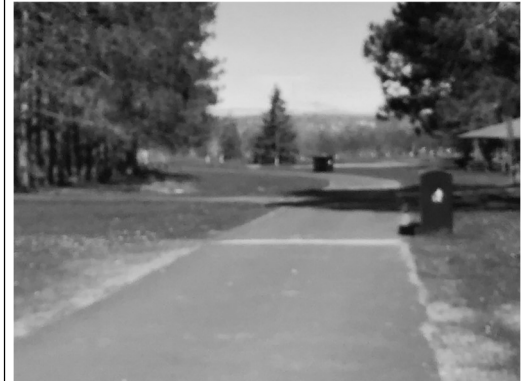
How it is - 2020

Usually around this time of year there is a huge flutter of activity in my home and in my life centered around getting ready for the art fair. And I can't believe I'm going to write....this year is different. And you all know it is different.