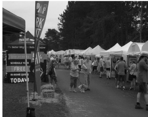
How it was - 2019