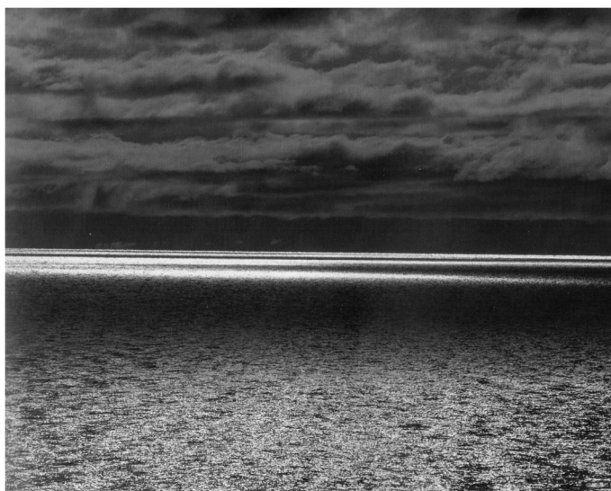
Black, White, Gray