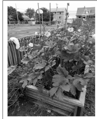
okra blossoms still blooming in September