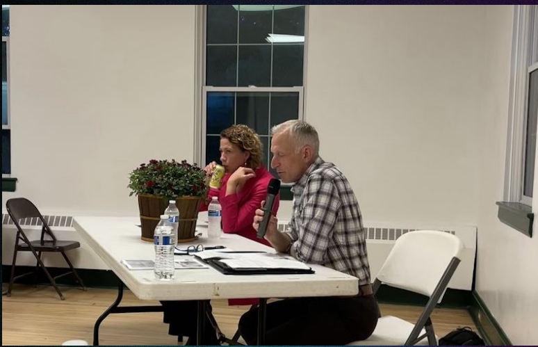
Hosting & facilitating the mayoral debate on Sept. 19th, 2023