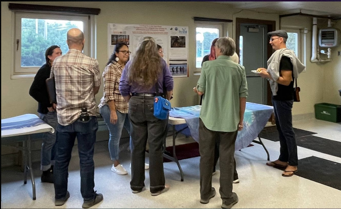
The Proof is in the Tree Rings, Indigenous Fire Shaped the forests on Minnesota and Wisconsin Point